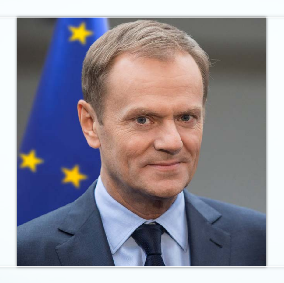
Donald Tusk Polish Presidency of the EU