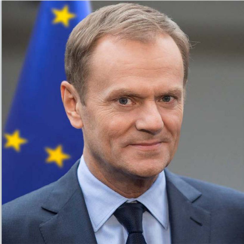
Donald Tusk Polish Presidency of the EU