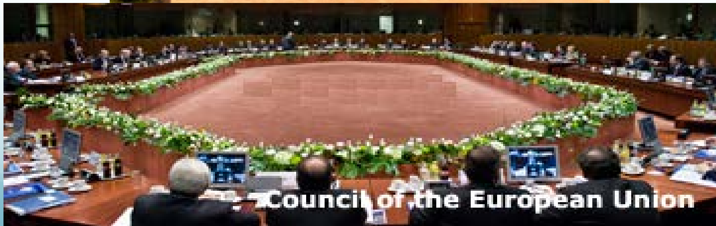
Council of the European Union